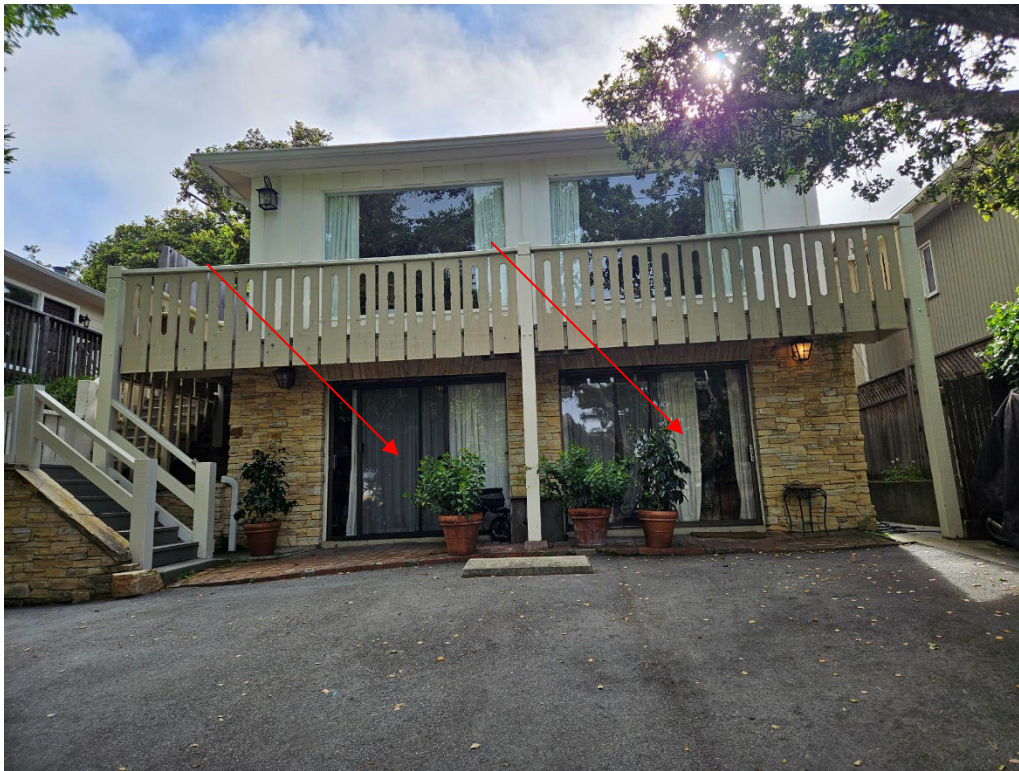
Figure 1: View of front elevation, looking east from Torres St. Arrows indicate non-original sliding glass doors.