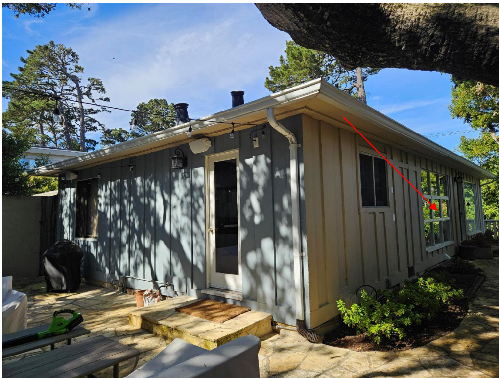
Figure 2: View of rear and north elevation. Arrow indicates enlarged window (1992).