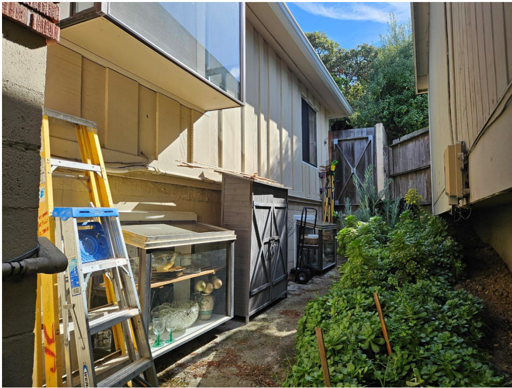
Figure 3: View of south elevation & bay windows added in 1979.