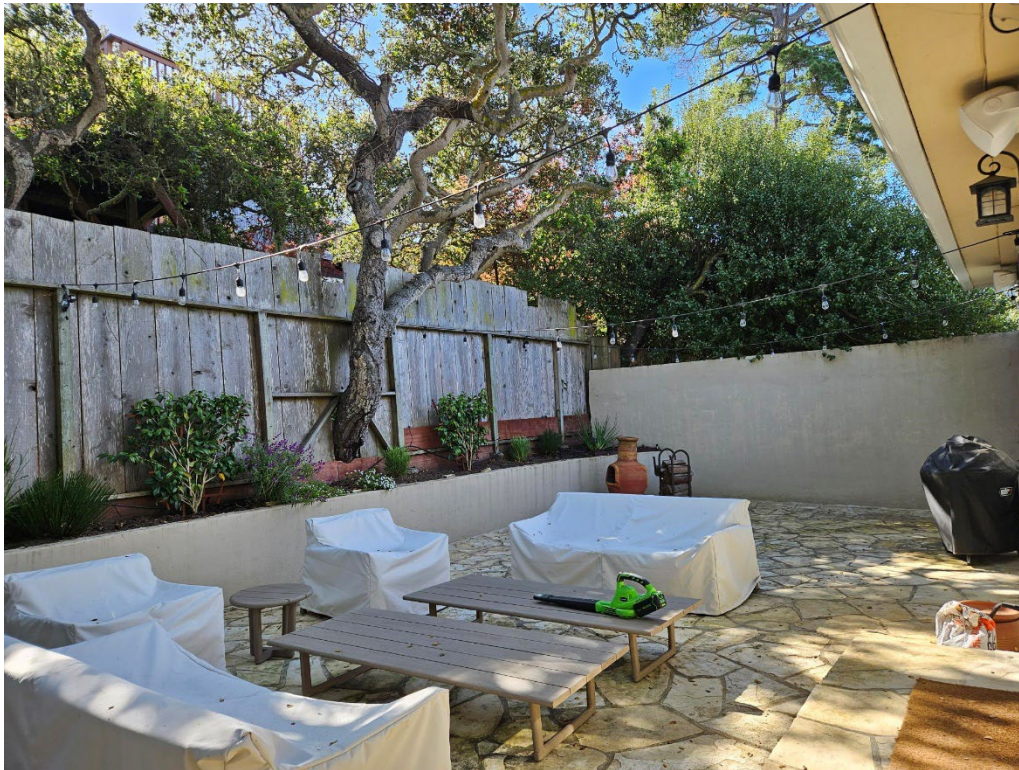
Figure 4: View of backyard.