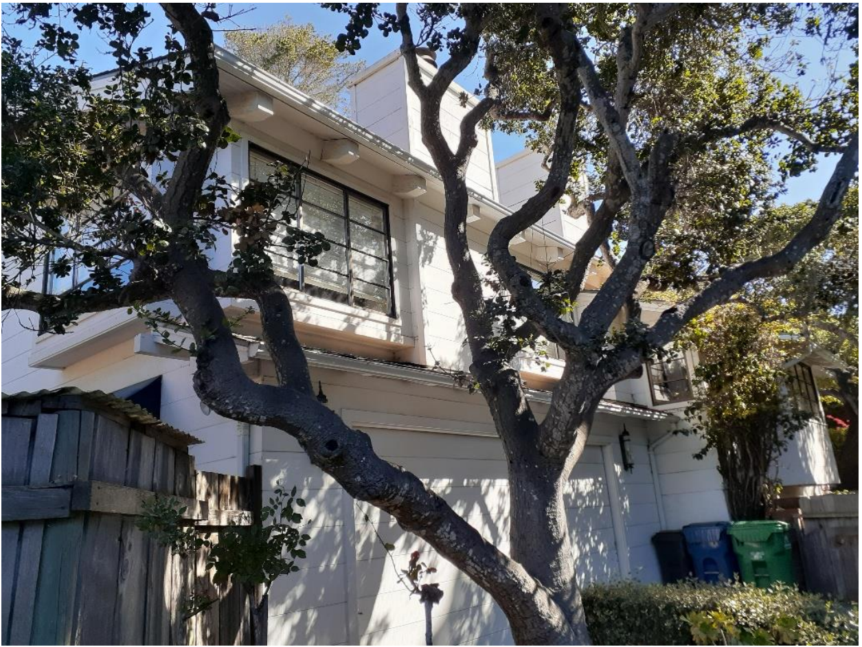
West Elevation Addition