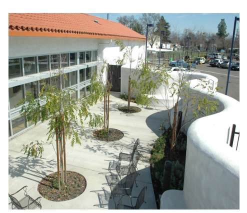
STRAWBALE WALL AND COURTYARD AT THE VISALIA POLICE SUBSTATION