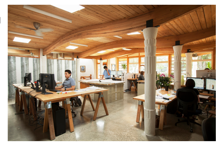
NATURAL DAYLIGHT ILLUMINATES THE INTERIOR OF INDIGO'S OFFICE SPACE

and functionality for the budget available. Every improvement considered will be evaluated based on public safety functionality, security, cost, and life cycle cost. Our team has remodeled many similar facilities and is expert at finding the least-cost solutions to the issues that inevitably arise when renovating an existing building. Our commitment is to meet all code and regulatory requirements, including those for Essential Service Buildings, in the most direct and cost-effective manner possible. An advantage of our team of architects and engineers is that we are