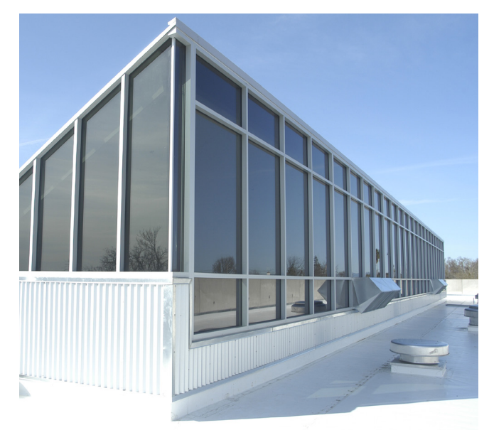
SKYLIGHT ON LEED CERTIFIED POLICE HEADQUARTERS, WOODLAND. CA