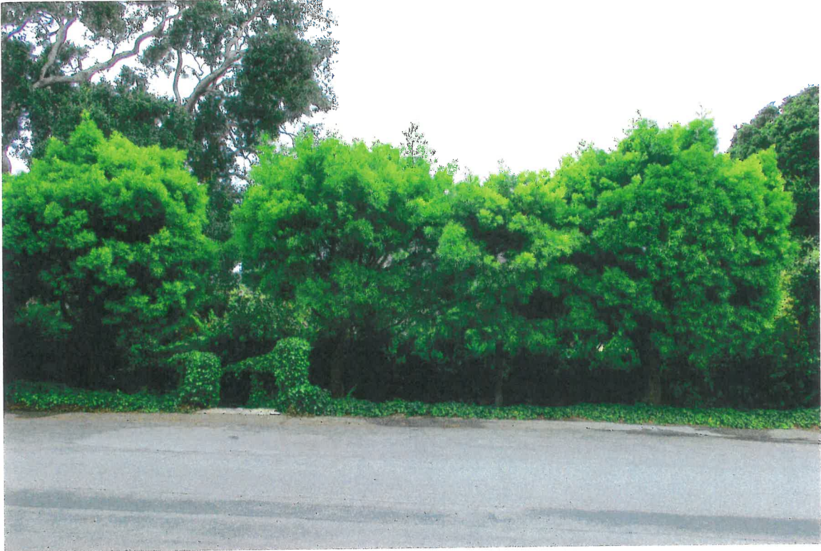
Photo #1. Looking west at the east facing landscape setting on the west side of Carmelo, Kent Seavey, September, 2019.