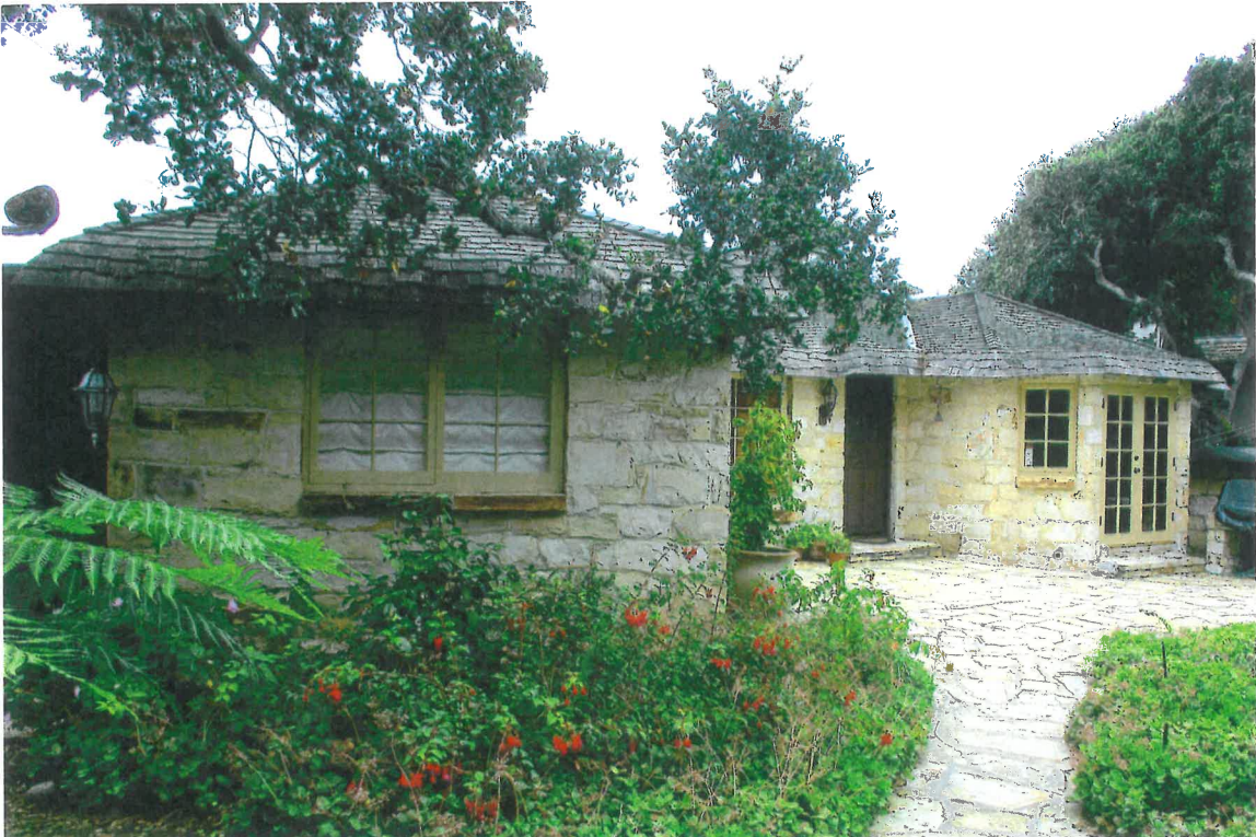
Photo #2. Looking NW at the east facing facade. Note 1952 window to French door alteration to right, Kent Seavey, September, 2019.