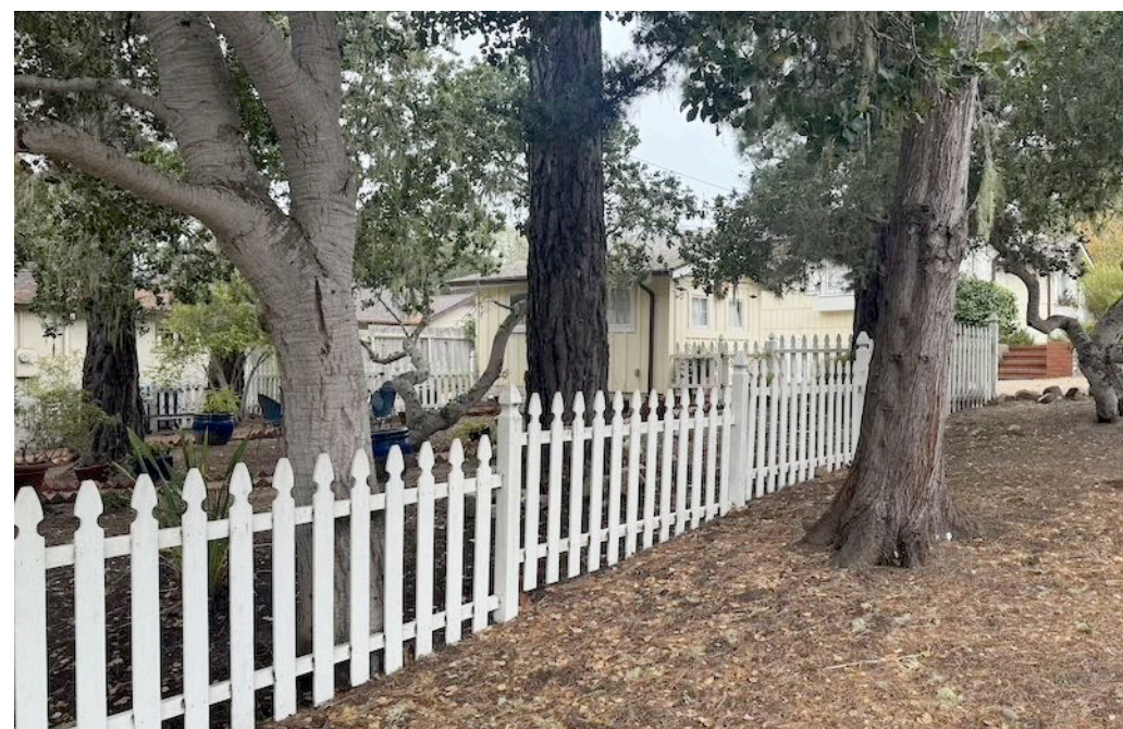
Existing Fence Along 12th Avenue