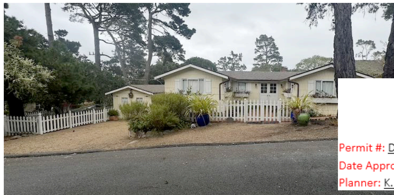
Existing Fence Along 12th Avenue