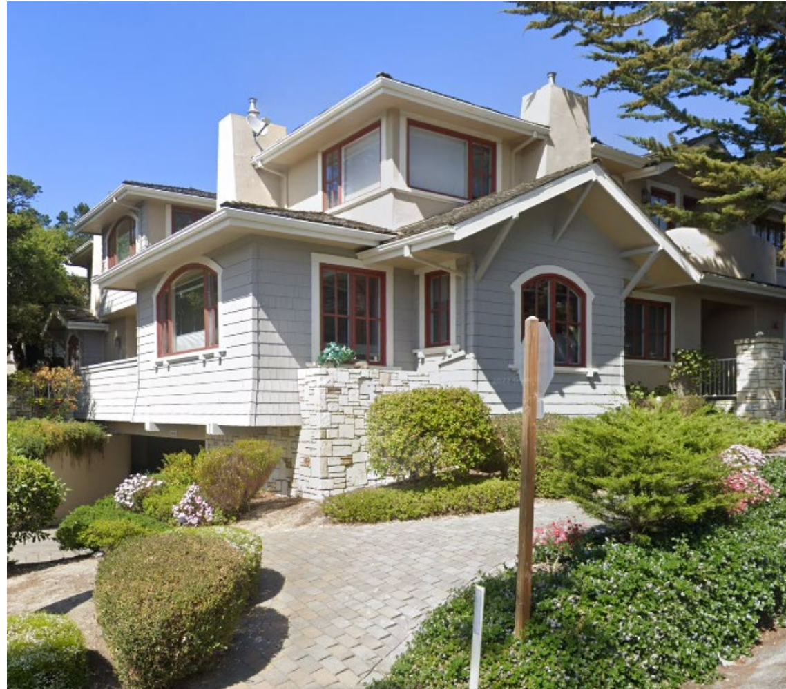
NE Mission and 4th

5 units total 2 condominiums 3 apartments