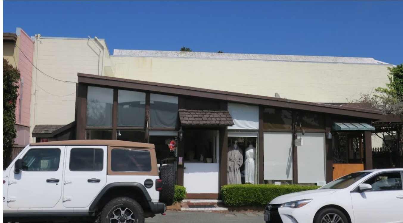
Dolores between 5th & 6th Avenues