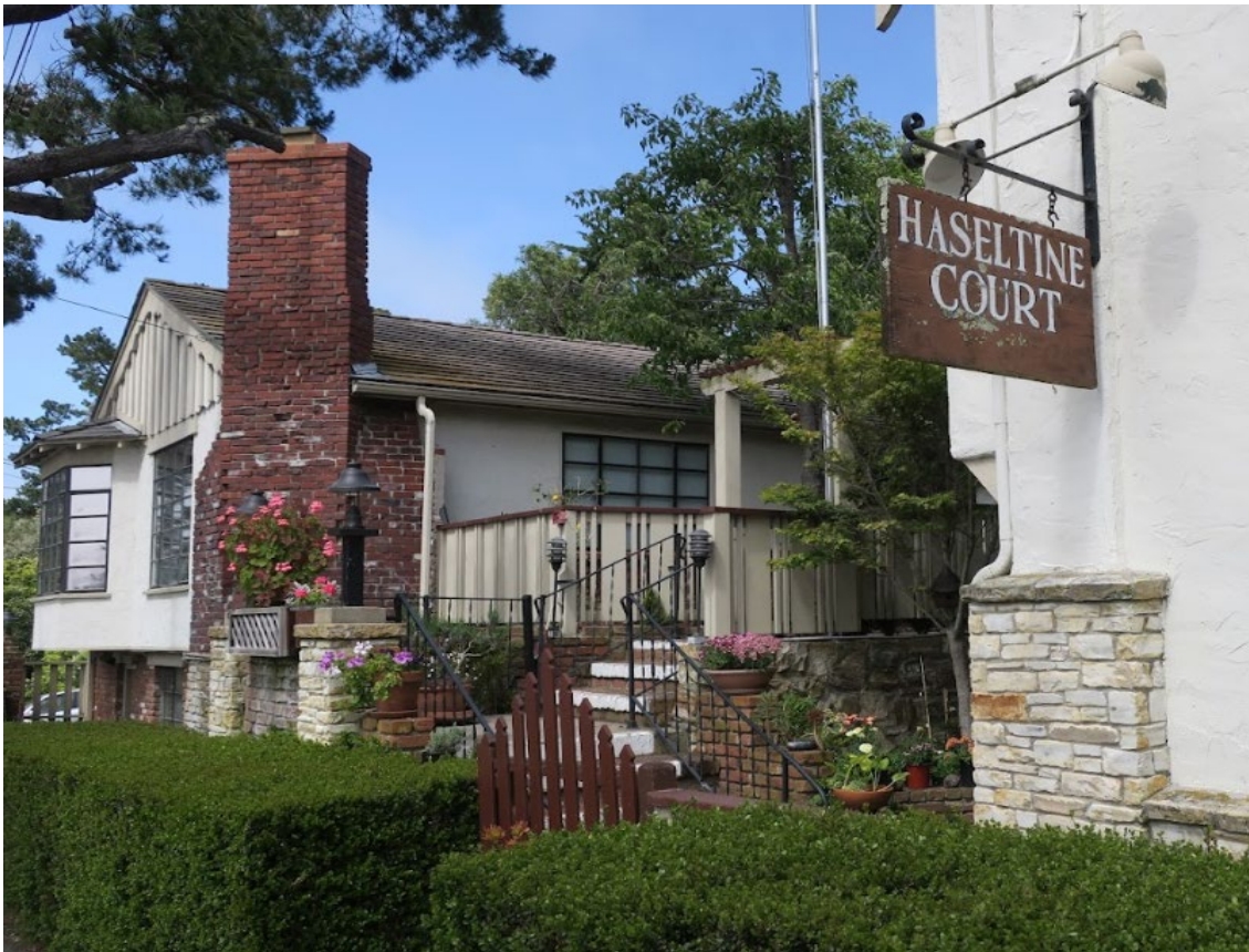
Haseltine Court, SE Lincoln & 5th

This is what affordable housing looks like in Carmel: