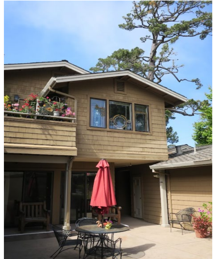
Norton Court, NW Dolores and 5th