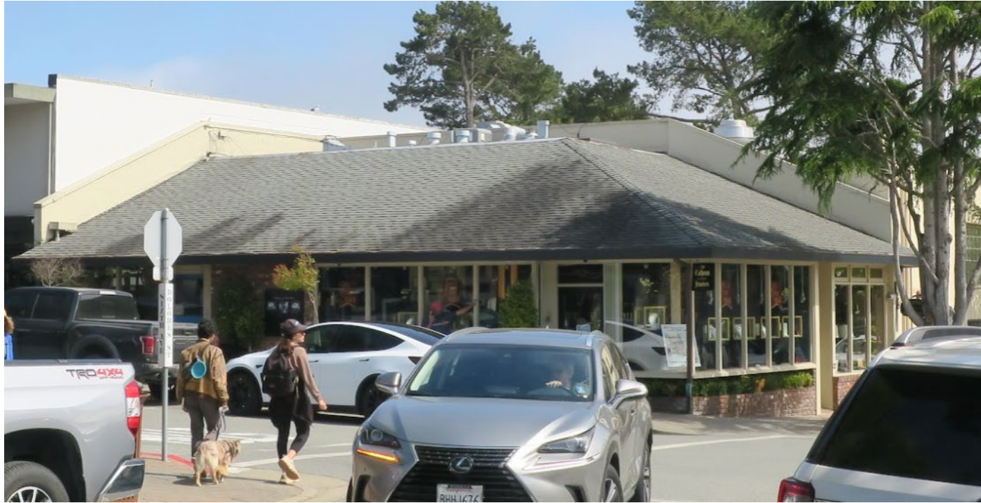
Dolores & 6th Avenue