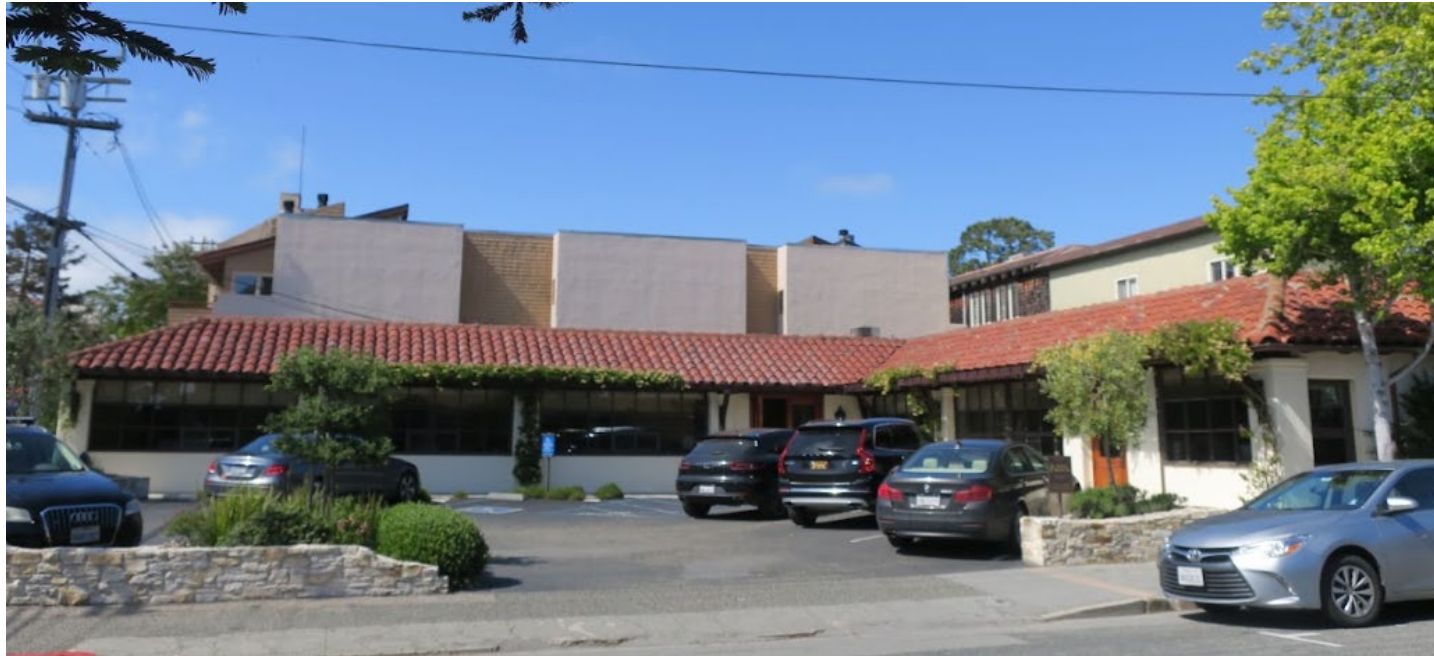
Carmel Realty Office, NEC Dolores & 8th Avenue