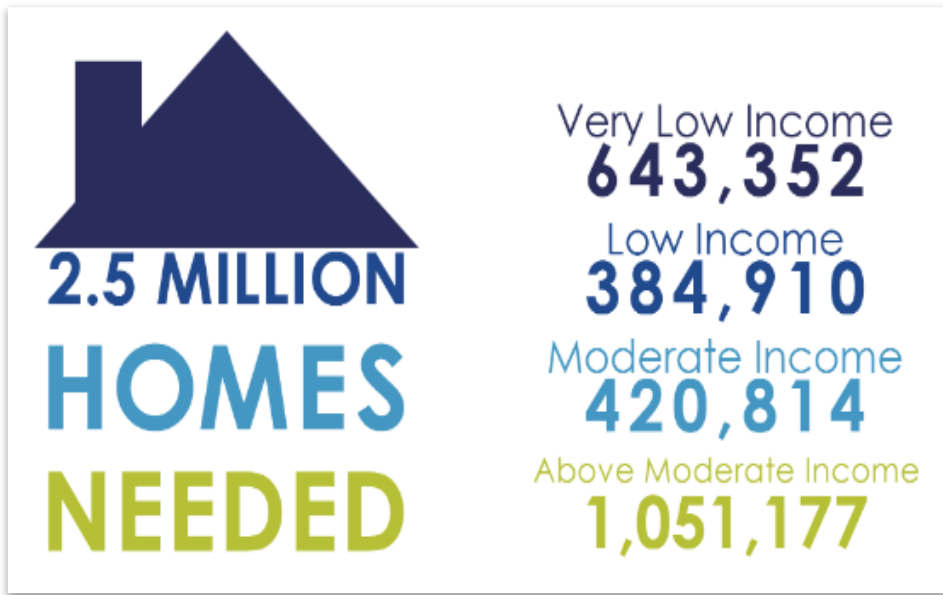
STATE: 2.5 million units