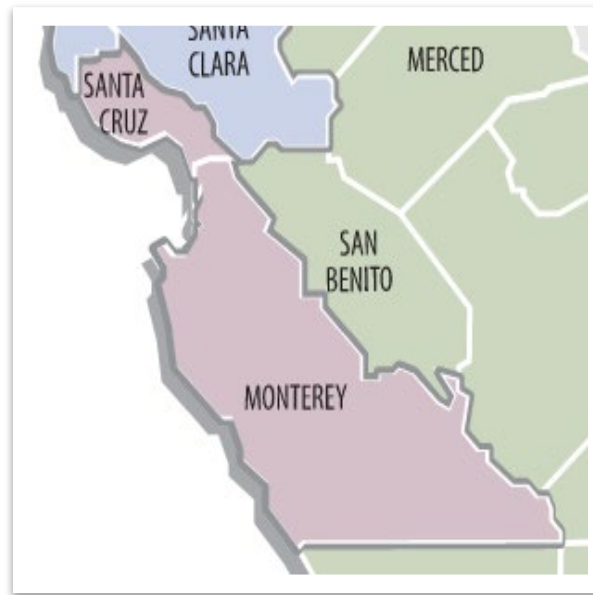
AMBAG: 33,274 units