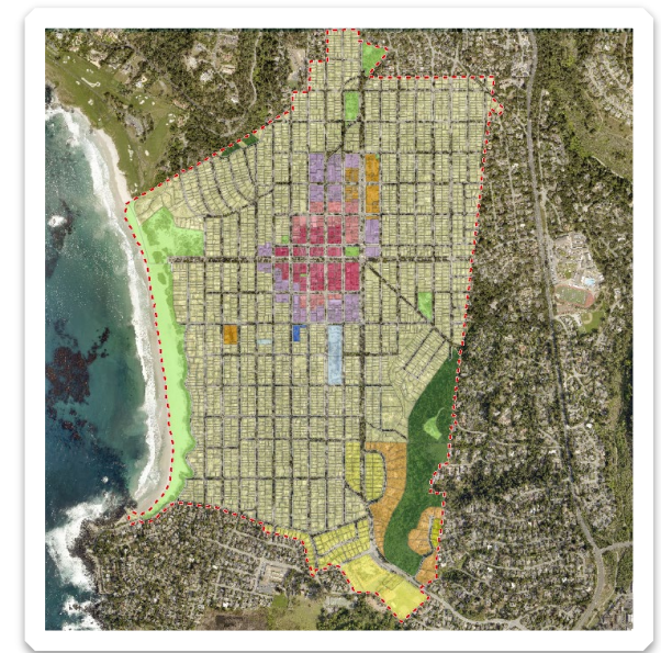
CARMEL: 349 units