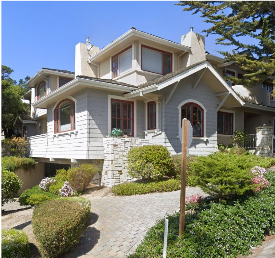
NE Mission and 4th

This is what affordable housing looks like in Carmel: