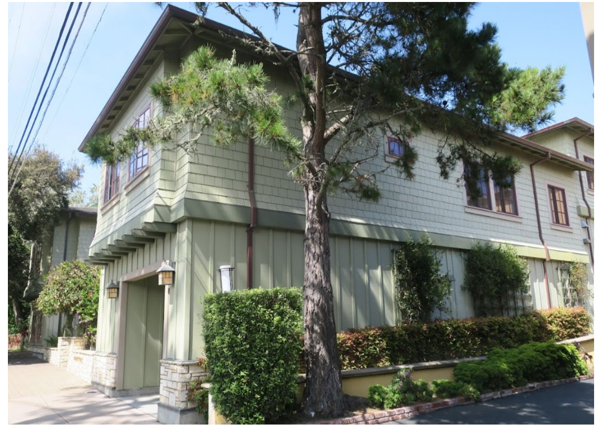
Trevett Court, Dolores 4 NW of 5th