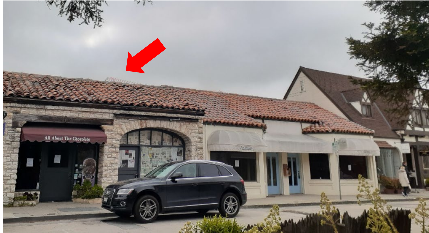
Dolores between Ocean and 7th Avenue

Historic Percy Parkes Building 3 apartments approved