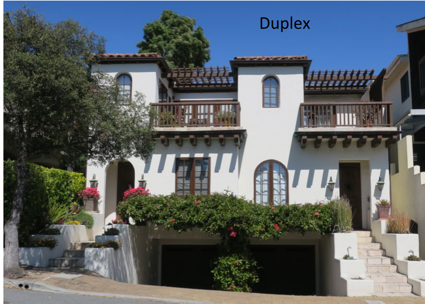
Mission 3 SE of 4th