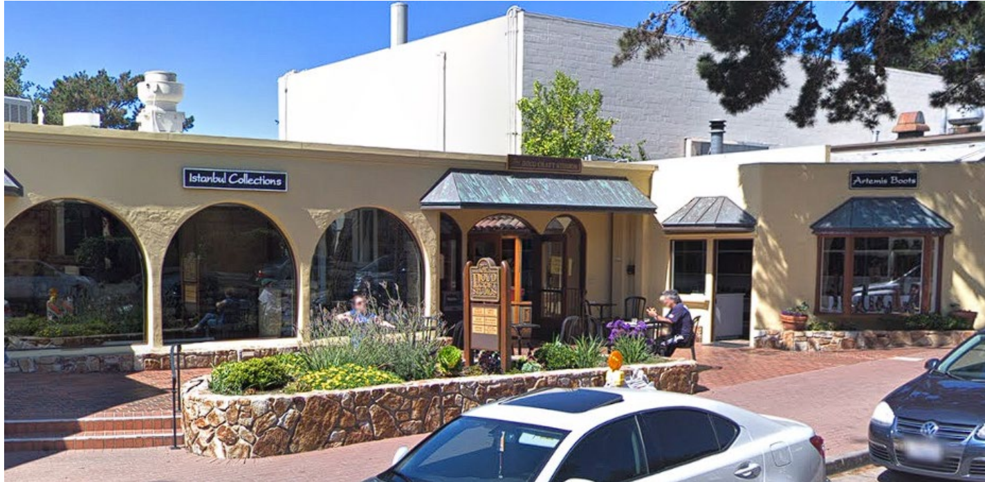
Doud Arcade, San Carlos between Ocean & 7th Avenue