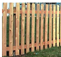
Fencing appropriate for front or side yards facing a street