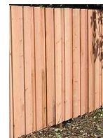
Fencing appropriate for rear or interior side yards