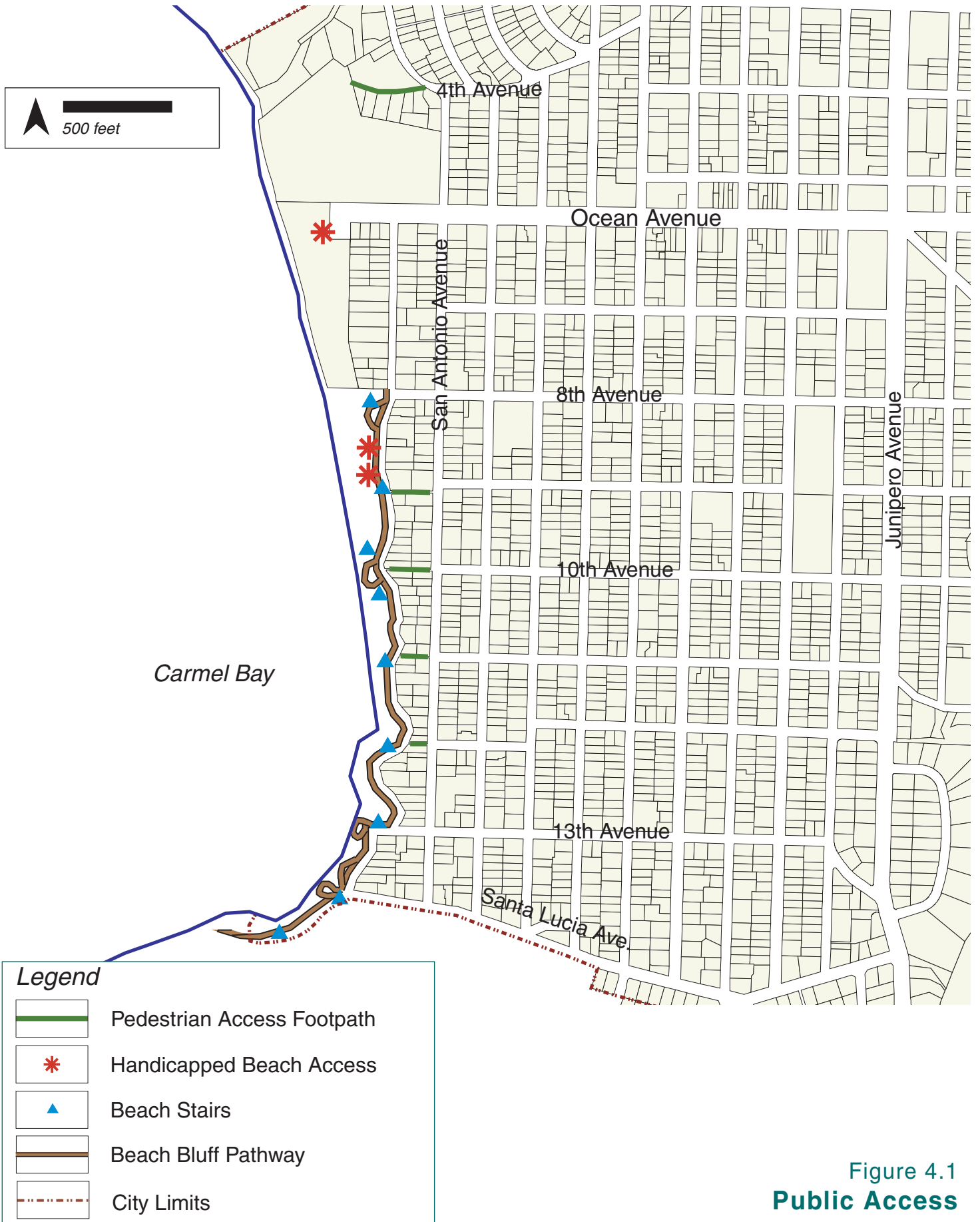
Figure 4.1 Public Access